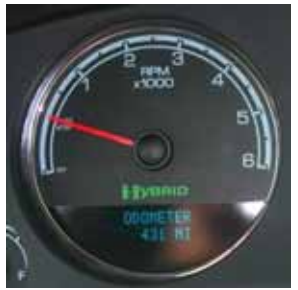
Tachometer with Auto Stop Indicator

A tachometer with Auto Stop indicator and an Economy gauge are unique to these vehicles