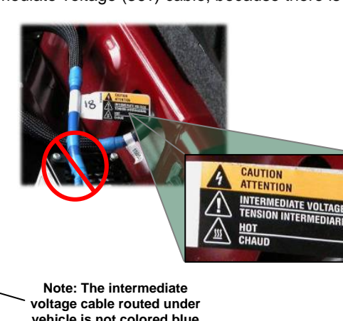
CAUTION: Cutting the intermediate voltage cable may result in an arc hazard

vehicle is not colored blue but is housed in a metal conduit