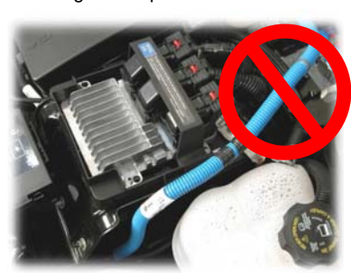
CAUTION: Cutting the blue cable may result in an arc hazard.

Do NOT cut the blue intermediate voltage (36v) cable, because there is a higher arc potential.