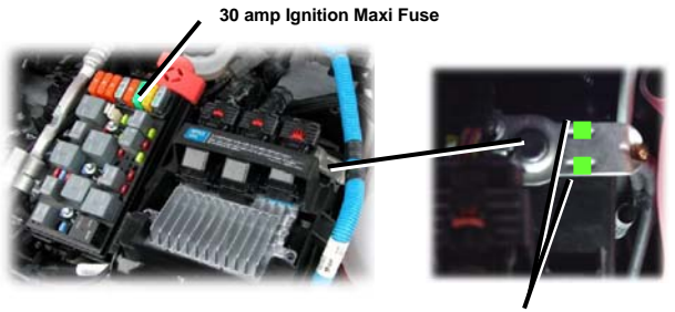
Cut here to disable BOTH 12v negative cables at the same time

2. Disconnect or cut BOTH 12v negative (-) battery cables